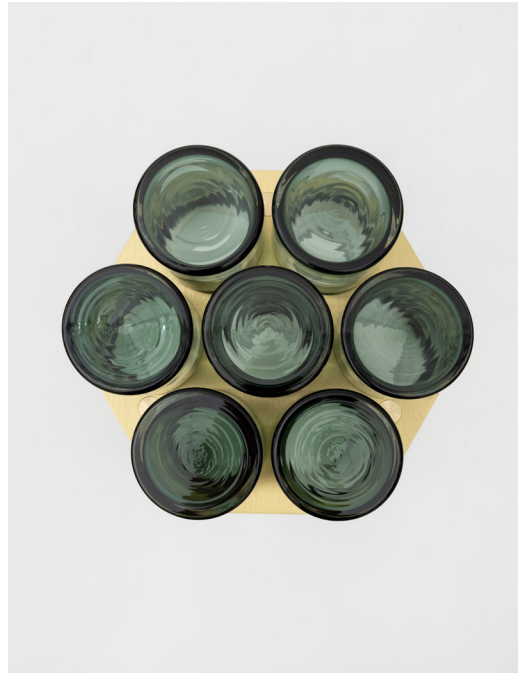
From left: Olivin and Smoke, both Brushed Brass metal finish