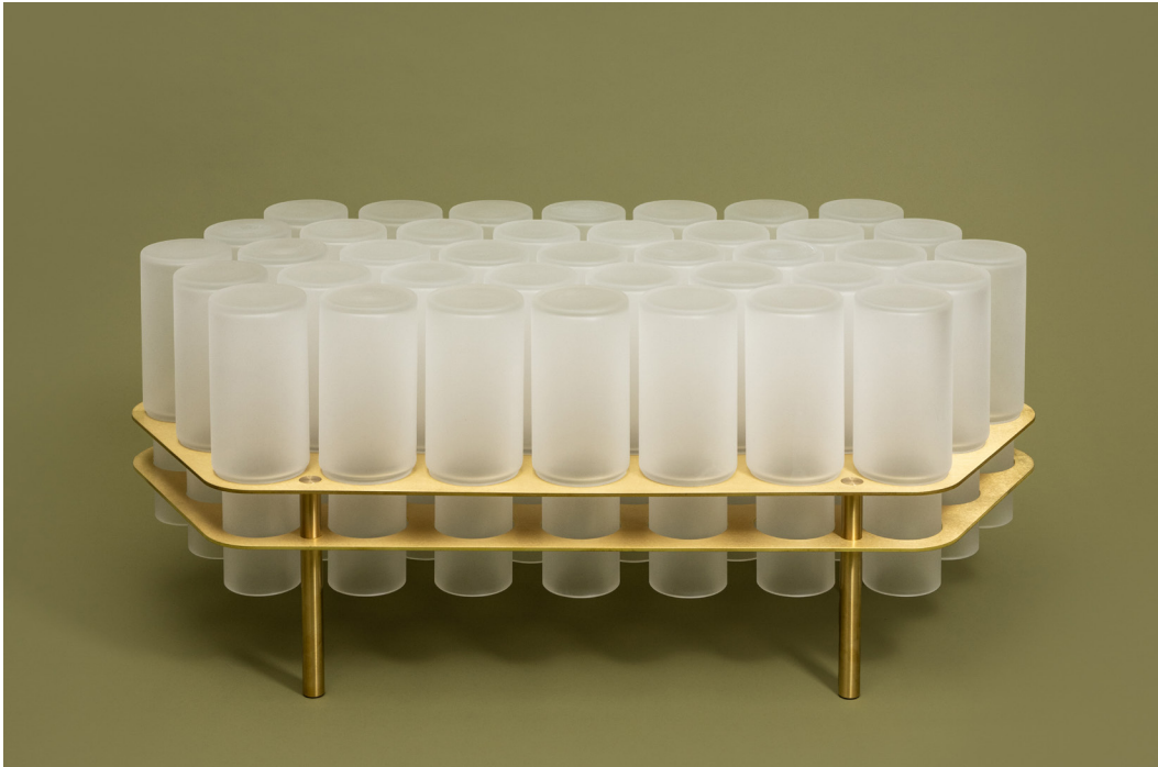
Clear Frosted glass, Brushed Brass metal finish