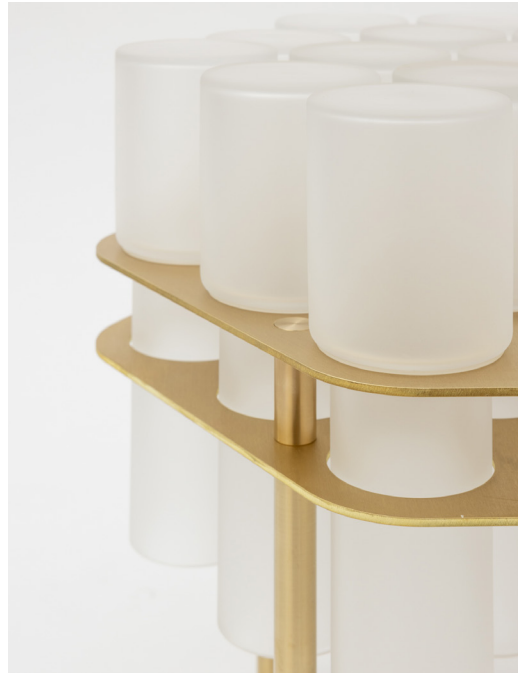
Clear Frosted glass, Brushed Brass metal finish