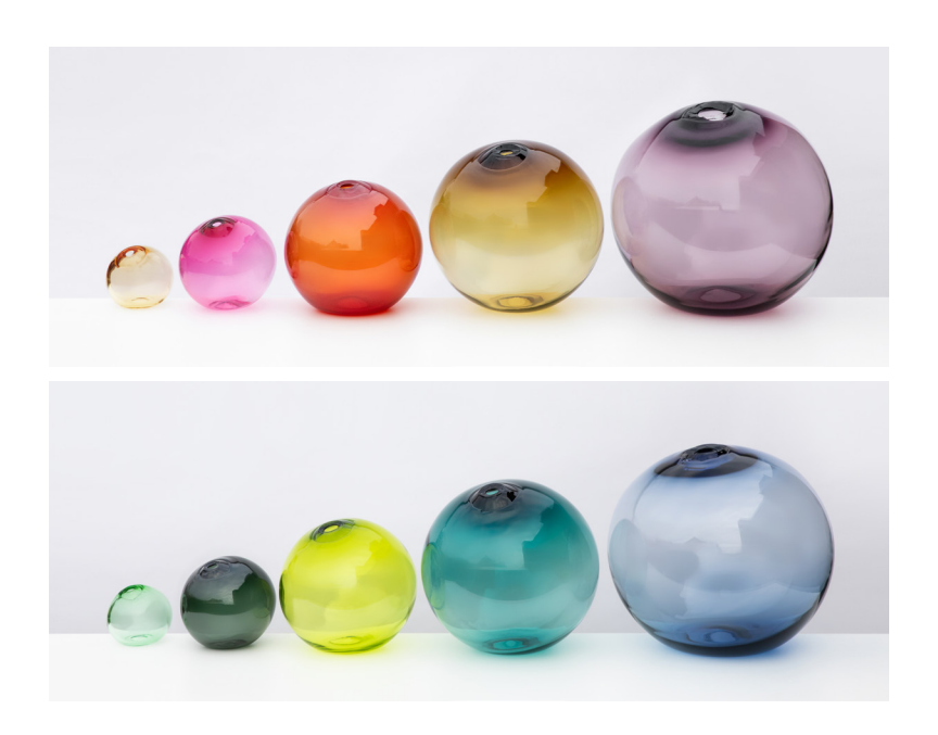
Top, from left: 6" Whiskey, 8" Fuchsia, 12" Strawberry, 16" Sargasso, 20" Plum Bottom, from left: 6" Light Green, 8" Smoke, 12" Lime, 16" Pine Tree Green, 20" Steel Blue