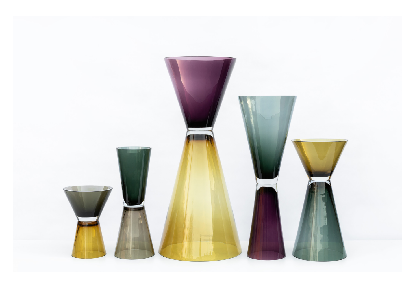
from left: shape 1, shape 2, shape 3, shape 4 and shape 5