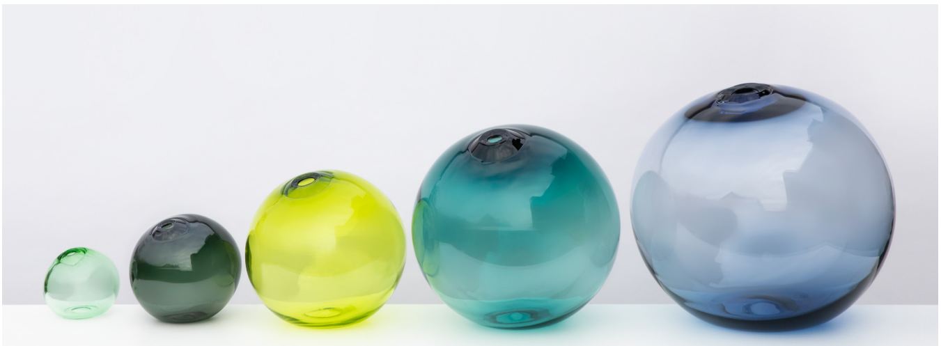
from left: 6" light green, 8" smoke, 12" lime, 16" pine tree green, 20" steel blue