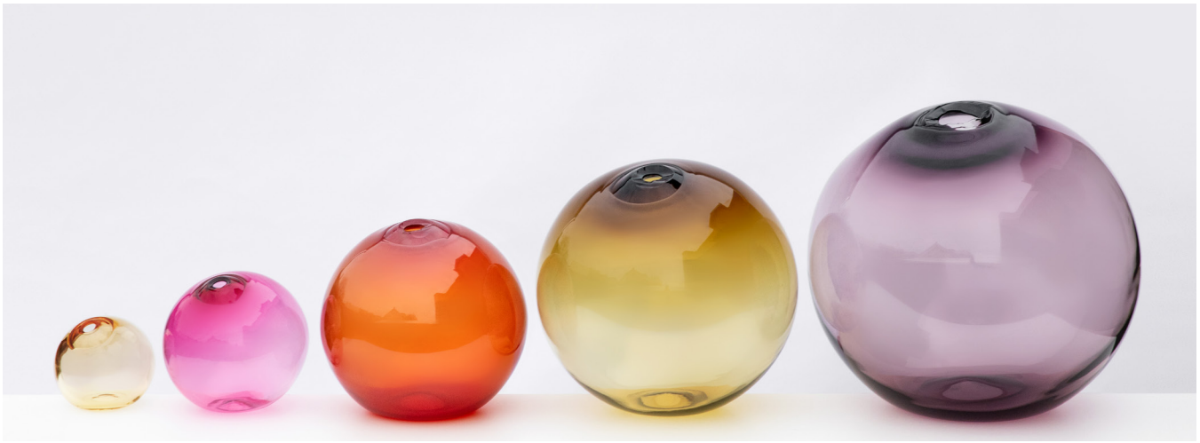
from left: 6" whiskey, 8" fuchsia, 12" strawberry, 16" sargasso, 20" plum