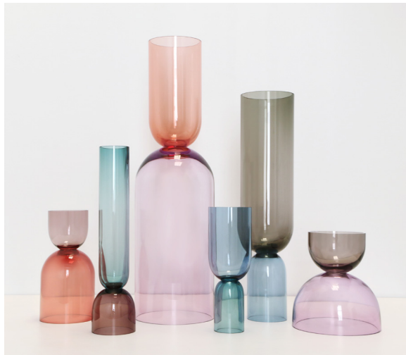
From left: Shape 1, Shape 4, Shape 3, Shape 5, Shape 2 and Shape 6