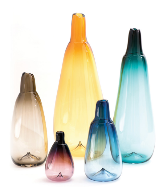
From left: Shape 3, Shape 1, Shape 5, Shape 2, Shape 4