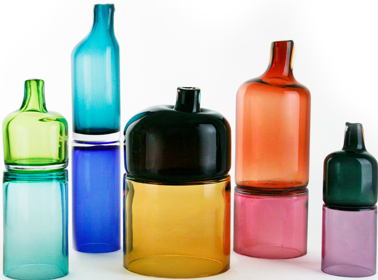
from left: olive/turquoise, lagoon/cobalt, brown/amber, brick/fuchsia, smoke/hyacinth