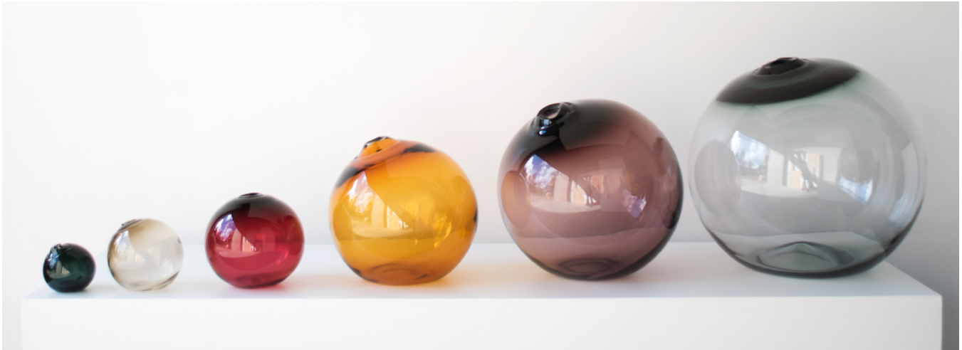
from left: 4"smoke, 6"olivin, 8"red, 12"amber, 16"plum, 20"smoke