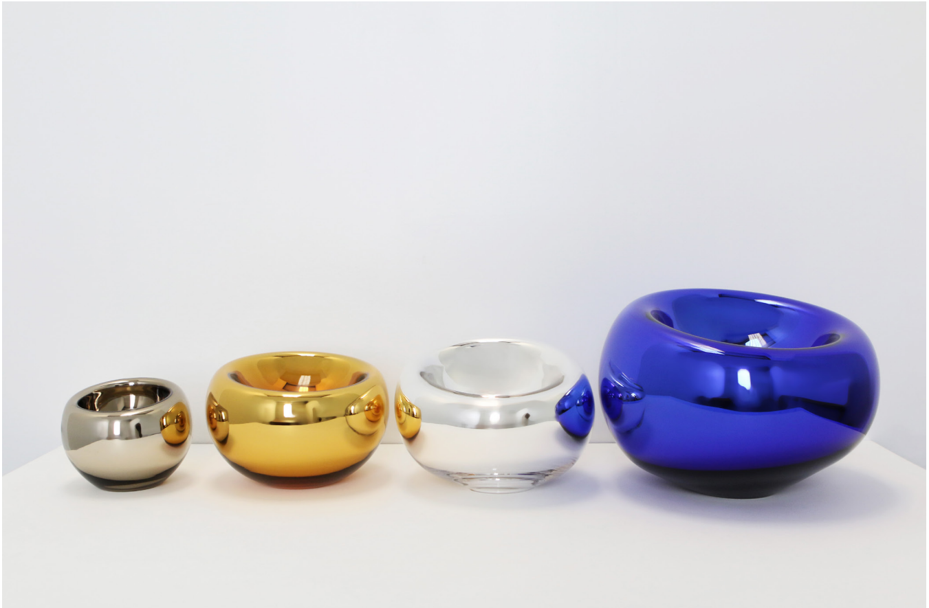
from left: small pewter, medium gold, medium silver and large blue