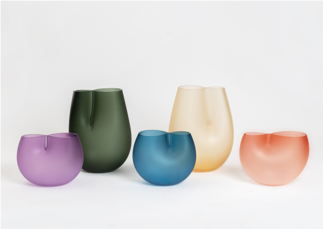
Back row from left: Large in Smoke Frosted and Whiskey Frosted Front row from left: Small in Violet Frosted, Steel Blue Frosted and Copper Ruby Frosted