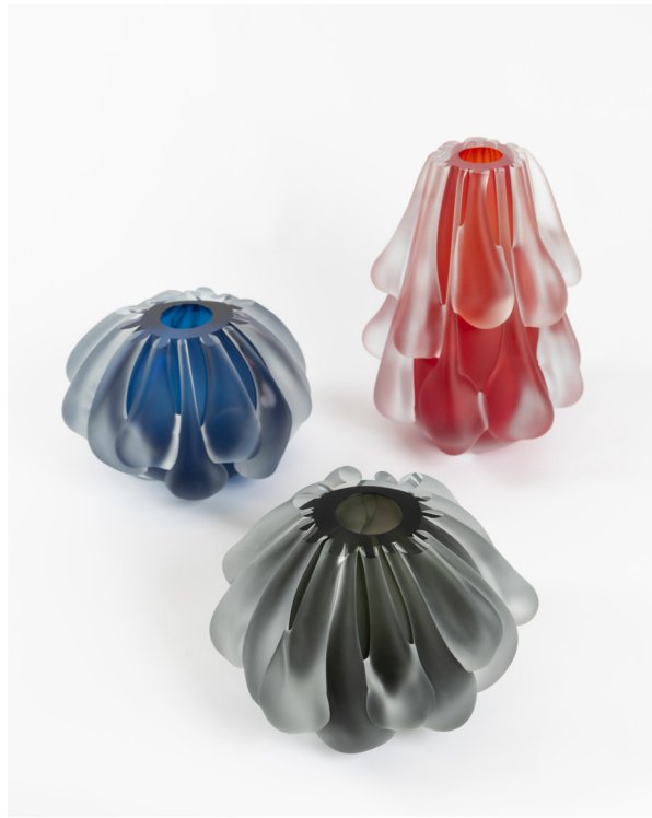
Clockwise from center: Round Steel Blue Frosted, Tall Strawberry Frosted, Round Smoke Frosted