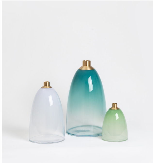
Left to right: Medium Oyster, Large New Blue, Small Pastel Green