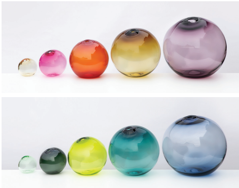
Top, from left: 6" Whiskey, 8" Fuchsia, 12" Strawberry, 16" Sargasso, 20" Plum Bottom, from left: 6" Light Green, 8" Smoke, 12" Lime, 16" Pine Tree Green, 20" Steel Blue