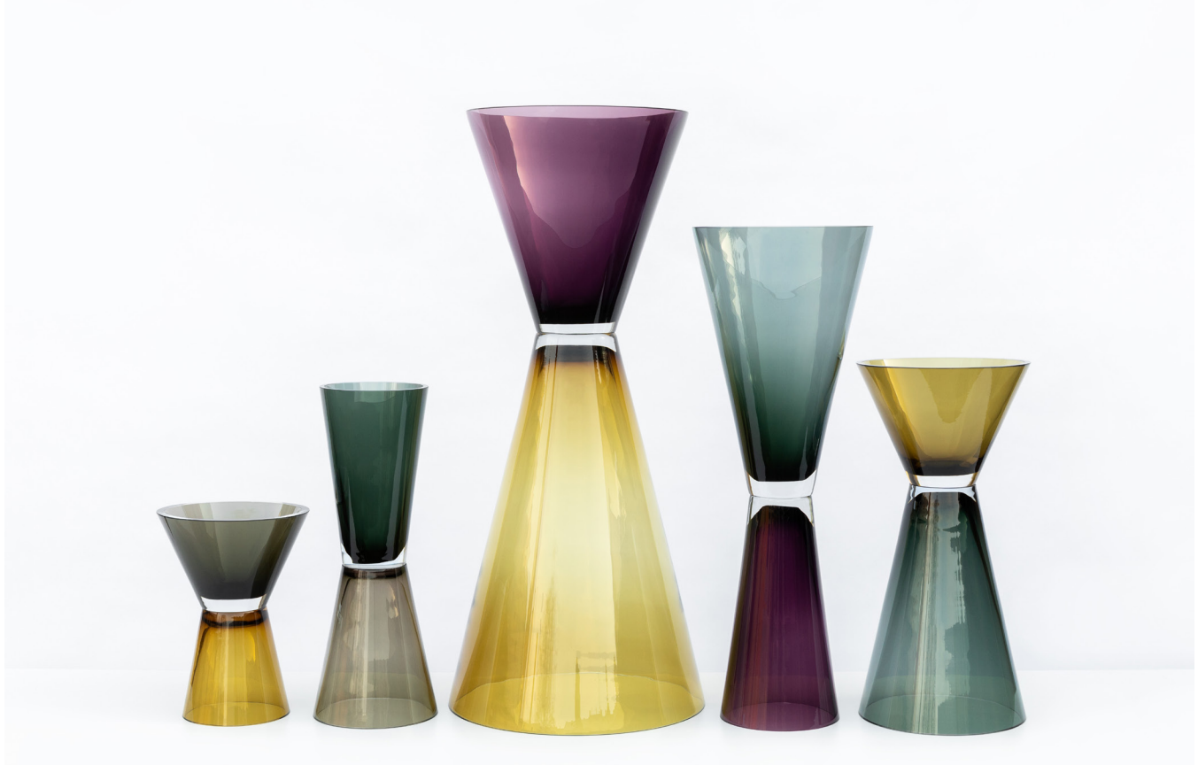
from left: shape 1, shape 2, shape 3, shape 4 and shape 5