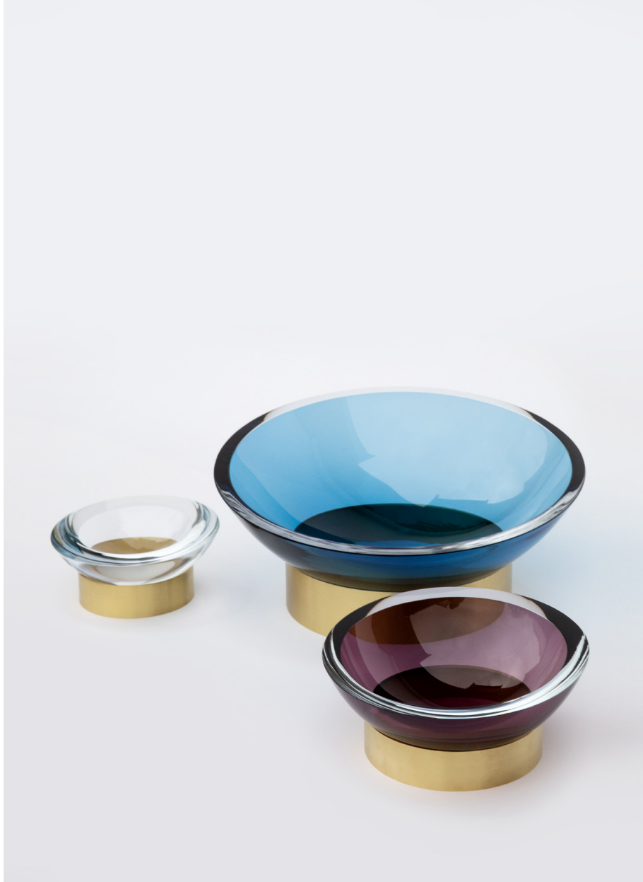
clockwise from left: small/clear, large/steel blue, medium/plum