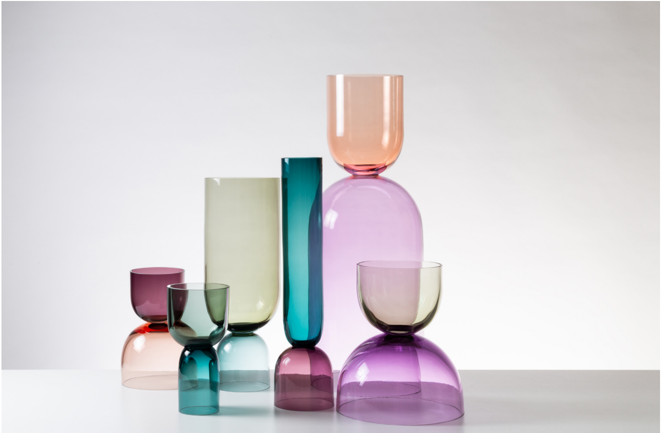
from left: shape 1, shape 5, shape 2, shape 4, shape 3 and shape 6