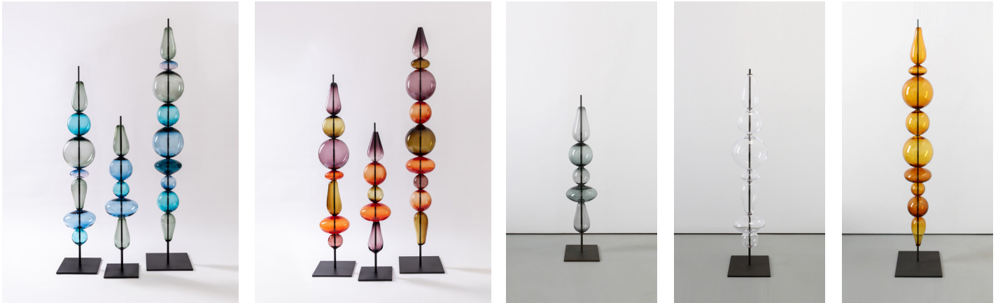
Medium, Short and Tall in multi-color Blue and Red Palettes All with Dark Oxidized steel stands