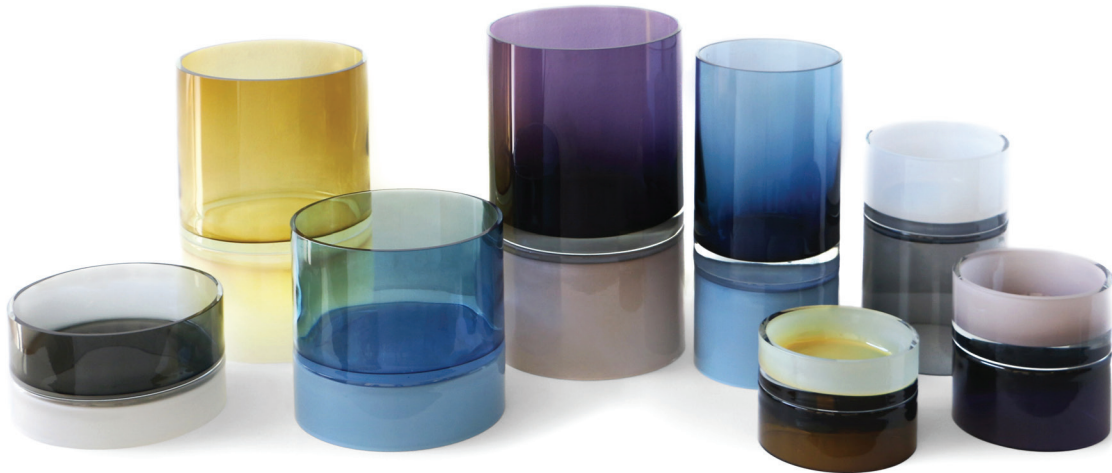
From left: VA304PSM, VA306PYL, VA305PBL, VA307PPR, VA303PBL, VA300PYL, VA302PSM, VA301PPR